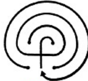
Step 5: Loop Four