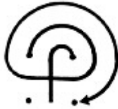
Step 4: Loop Three