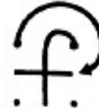
Step 3: Loop Two